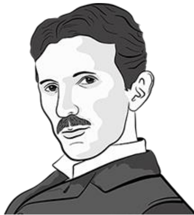
Nikola Tesla was born in the Austrian Empire, but later became an American citizen

Since time i_____ , the world _____ been graced by a number of exceptional human beings. _____ it in science, politics, sports _____ the arts, there are individuals who have proven, through their a_____ (Book 1, pg 29; qualities) and accomplishments, to have been a cut _____ the rest of us. Of these remarkable individuals, Nikola Tesla would perhaps be a particularly interesting figure. Born in 1856, Tesla _____ a scientist and inventor whose contributions helped m_____ modern living possible. He contributed to many of the first breakthroughs in r_d_ , r_d_ and energy research, and is also famous for developing the electrical system now i_____ (Book 3, pg 53; vital) in homes and offices around the world. Undoubtedly, Tesla would _____ have been as successful if not for the admirable qualities he p_____ .